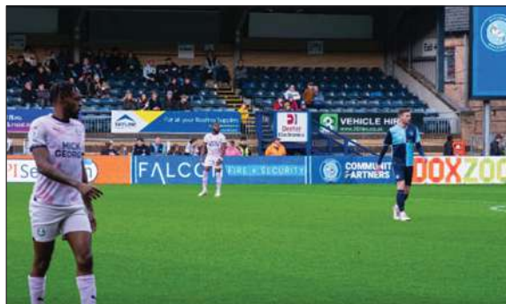
They are now community partners with Wycombe

FIRE and security systems expert, Falcon Fire and Security has signed to become a Community Partner with Wycombe Wanderers.