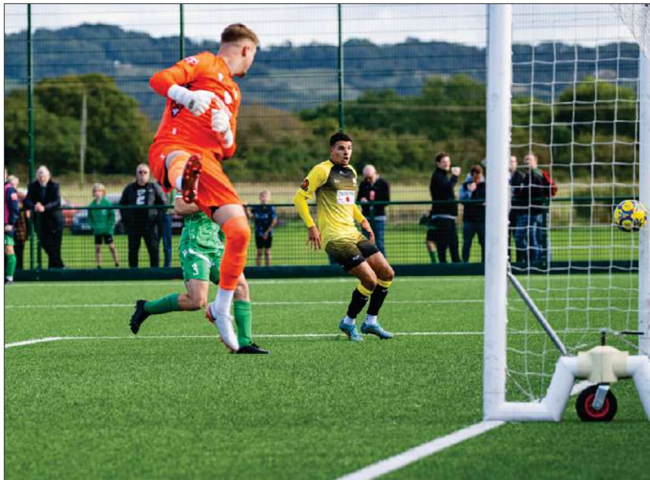
Chesham United hit the post in their FA Cup clash with Bishops Cleeve.