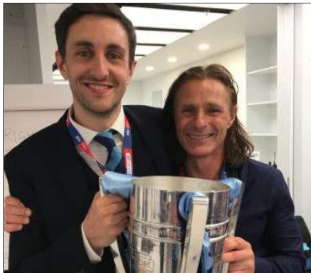
Two very popular faces at Adams Park holding the League One playoff trophy (Matt Cecil)