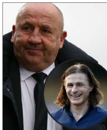
John Coleman heaped the praise onto Wycombe boss Gareth Ainsworth

They have also kept 11 clean sheets this league campaign, which included three consecutive block outs in October.