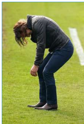
It was another defeat

ACCRINGTON came from behind twice to beat promotion-chasing Wycombe 3-2 in Sky Bet League One.