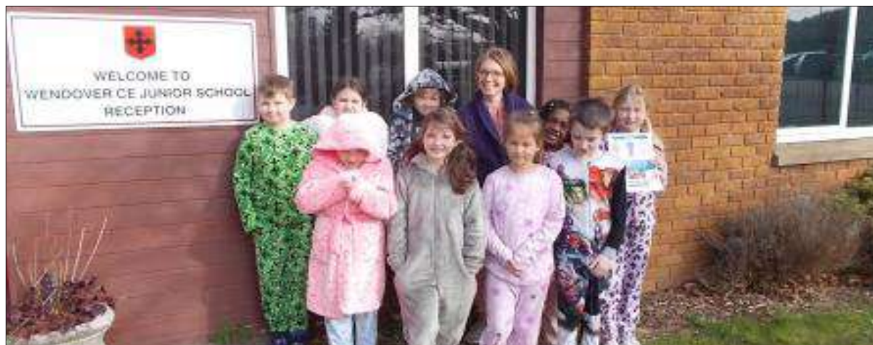
Children at Wendover C of E Junior School dressed in their pyjamas

MILITARY children from Wendover C of E Junior School have raised £530 for the national charity, Little Troopers, by coming to school in their pyjamas.