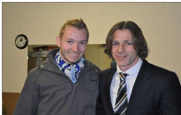
Posing for a photo at the start of his decade in charge of the club