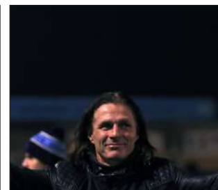
Gareth Ainsworth