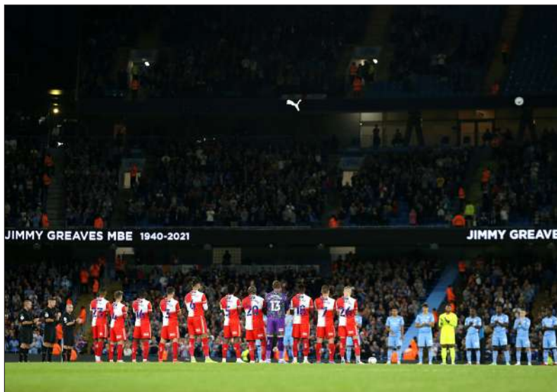
The late Jimmy Greaves was remembered before the match kicked-off at the Etihad

Here is a selection of photos from Wycombe's trip to the Etihad Stadium.