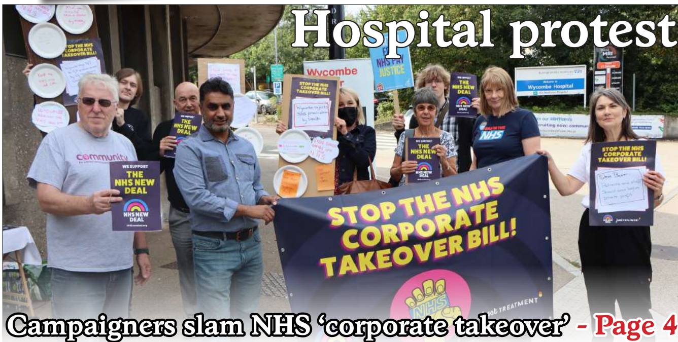
Campaigners slam NHS 'corporate takeover' - Page 4