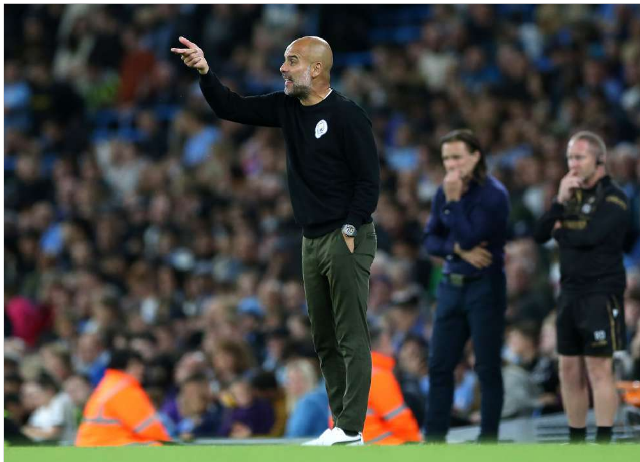
Pep Guardiola's Manchester City tore Wycombe Wanderers apart the Etihad Stadium, as the cup holders defeated the Chairboys 6-1