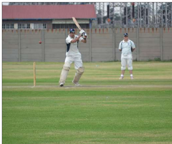
The match took place last week which saw Buckinghamshire beat Norfolk

It will take place between August 1 and August 3.