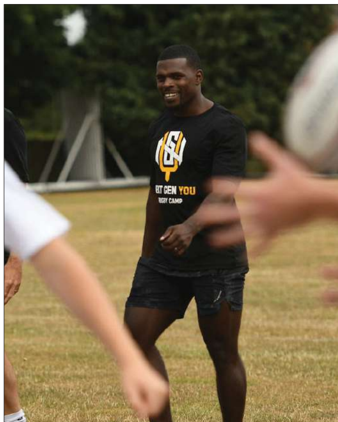
Christian was hands on during the camp in 2022

RUGBY star Christian Wade will return to his roots this summer following the success of his inaugural sports camp.