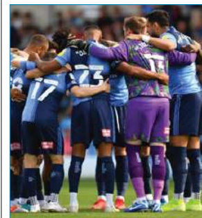
The season starts on July 30

If Wanderers are to go one better than last season's play off final and clinch automatic promotion to the Championship, they will have to finish above some of the biggest clubs in English football.