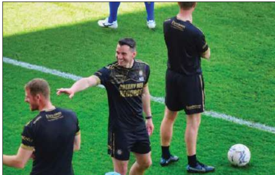
It was another win for Wycombe