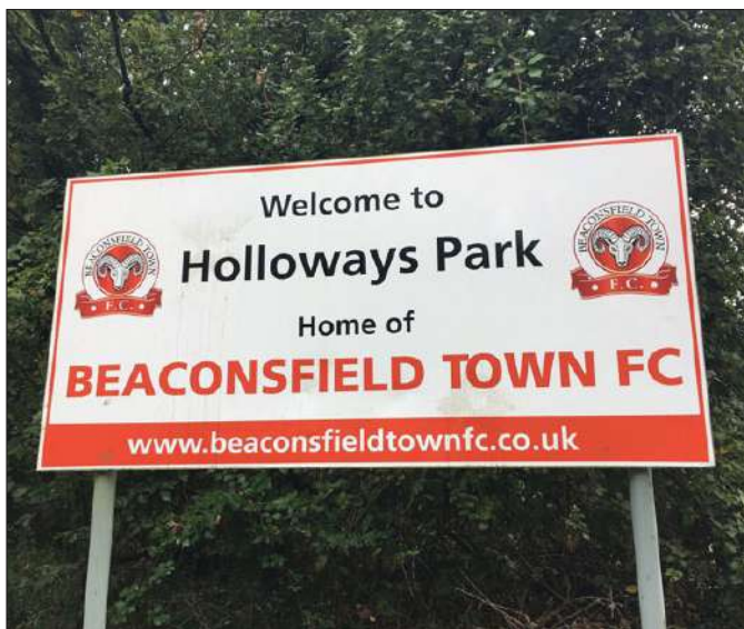
Beaconsfield play their home games at Holloways Park and under their new joint-managers, they have won three times

BEACONSFIELD Town are enjoying life under their new management team as they picked up their win in four matches.