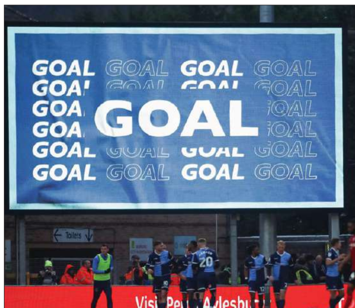
It's the first time Wanderers have completed the double over Bristol Rovers since the 2009/10 season

Perhaps he is the one who now needs a neck brace as he stares up at Wycombe's lofty position in the table, 15 points above his team!