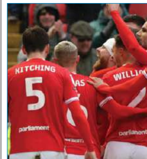
Barnsley are playing well

WITH 10 games left until the end of the season, every fixture is vital in Wycombe's quest to reach the play-offs, but the visit of Barnsley to Adams Park on Saturday, March 18 is more important than most.