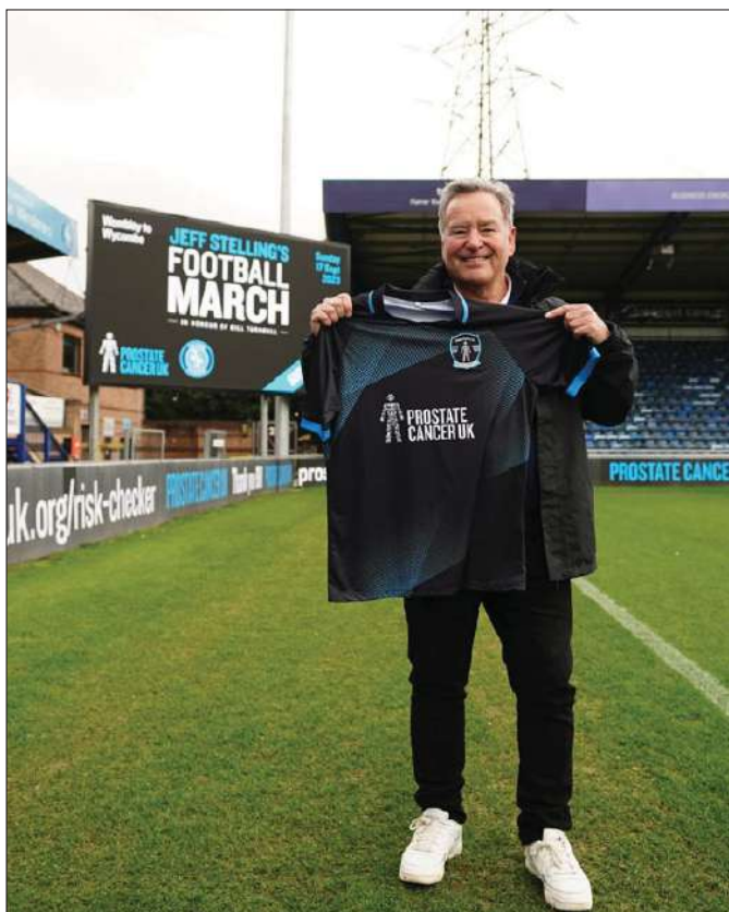
Jeff Stelling was at Adams Park on March 13 to confirm his latest walk to raise funds for Prostate Cancer UK

BROADCASTING legend and Soccer Saturday host Jeff Stelling will walk from Wembley Stadium to Adams Park in aid of Prostate Cancer UK.