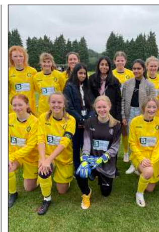
Wycombe Wanderers Women U18