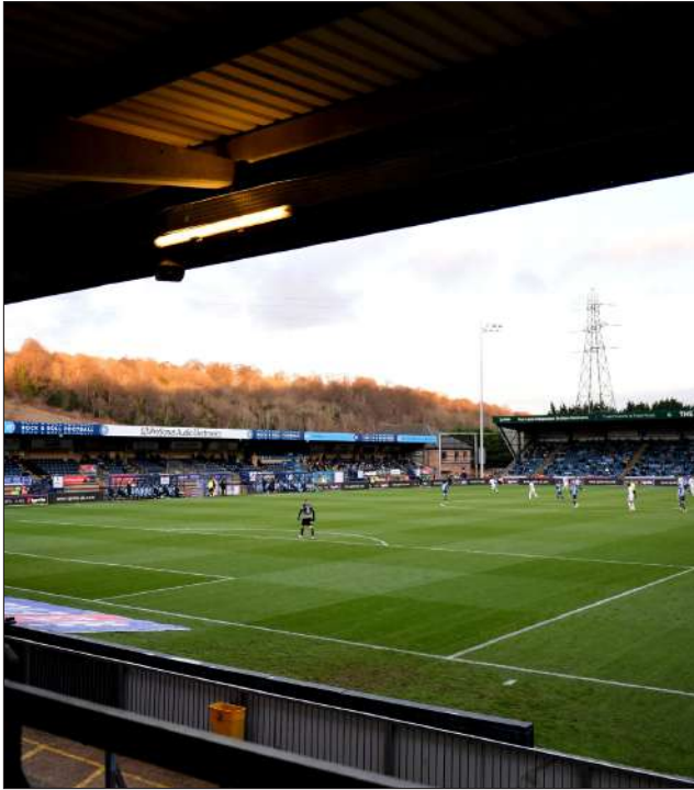
Wycombe will play Ipswich Town at Adams Park on November 2 after the original game was postponed due to international call ups