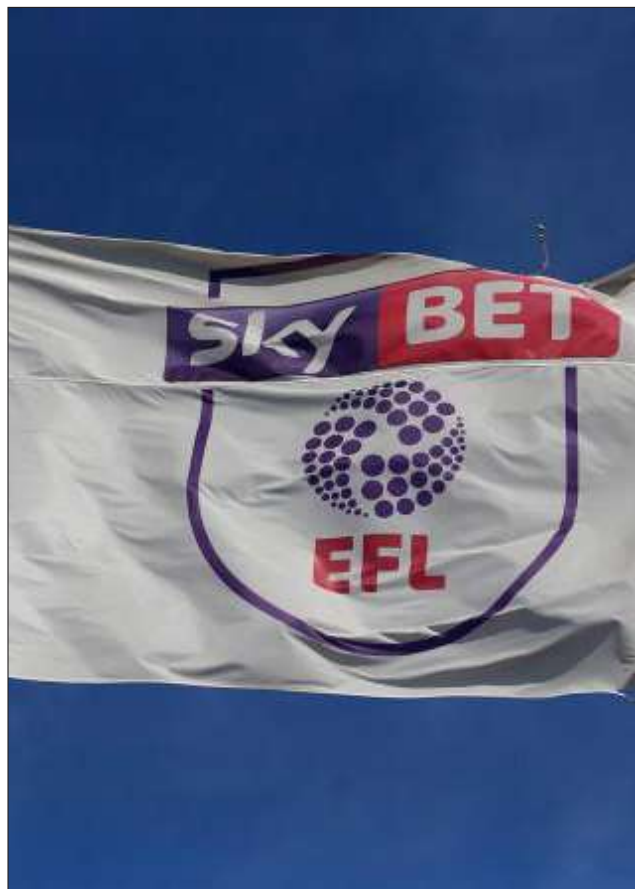
The EFL are against the plans which could see the FIFA World Cup be played every two years than the traditional four

THE Premier League and the EFL have expressed their opposition to a World Cup every two years.