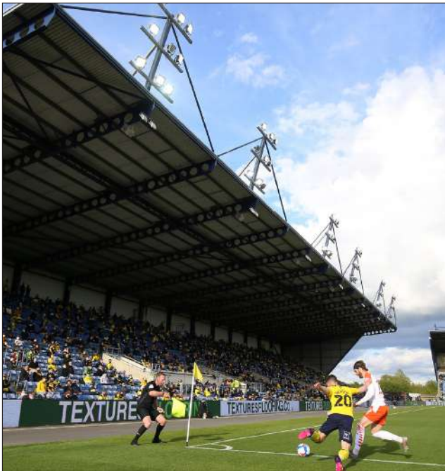
Several Wycombe fans will be making the short trip along the M40 to the Kassam Stadium this Saturday

WANDERERS' last meeting with Oxford United was arguably the greatest day in the club's history, as they secured promotion to the Championship via the Wembley play-off final.