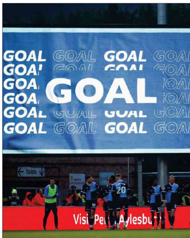
Wycombe will begin the season at home to Exeter City on August 5

WYCOMBE Wanderers are aiming to sign a further 11 players this transfer window.