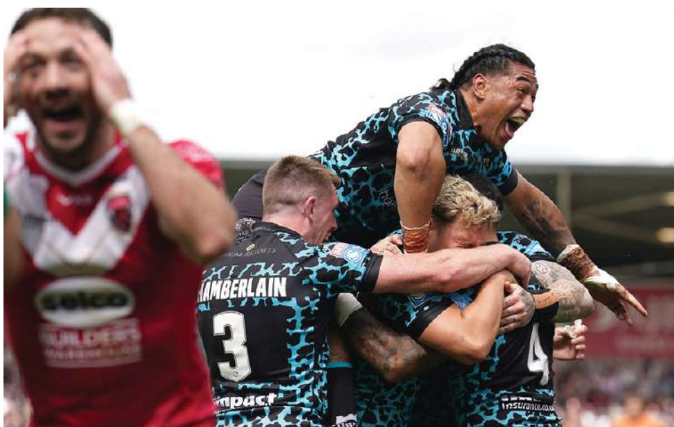
IT has been a special year for the newly-promoted Leigh Leopards, second in the league and in a Challenge Cup semi.

"So when they do go onto the Olympics it's not the first time they're thrust into that environment."