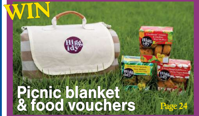
WIN Picnic blanket & food vouchers Page 24