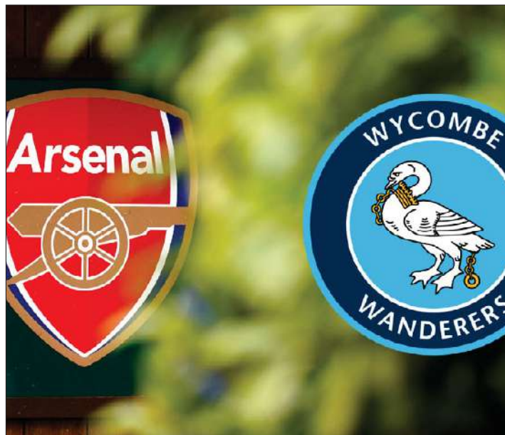
The Wycombe first-team defeated the Arsenal U21s 1-0 a team of trialists lost away at Hanwell