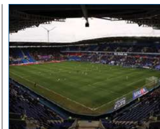
The old home of Tetek (PA)