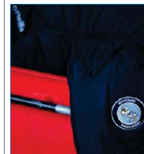
He spent a year at

A former Wycombe Wanderers player who failed to make a single league appearance for the club has found a new team.