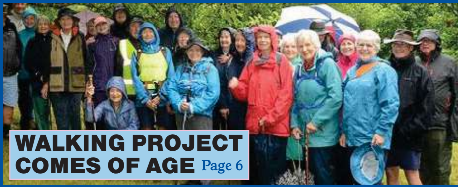
WALKING PROJECT COMES OF AGE Page 6