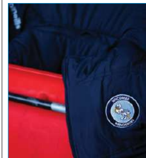
Wycombe Wanderers logo

THE name of Wycombe's next opponents Carlisle United, who visit Adams Park on Saturday, September 30, will forever have a special place in the club's history.