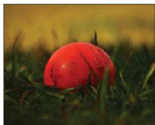
It's been a tough start for Bucks this summer

BUCKS men's poor form in white ball cricket this season continued when they crashed to a 124-run defeat to Cornwall in their National Counties Trophy Group 3 match at Redruth on Sunday.