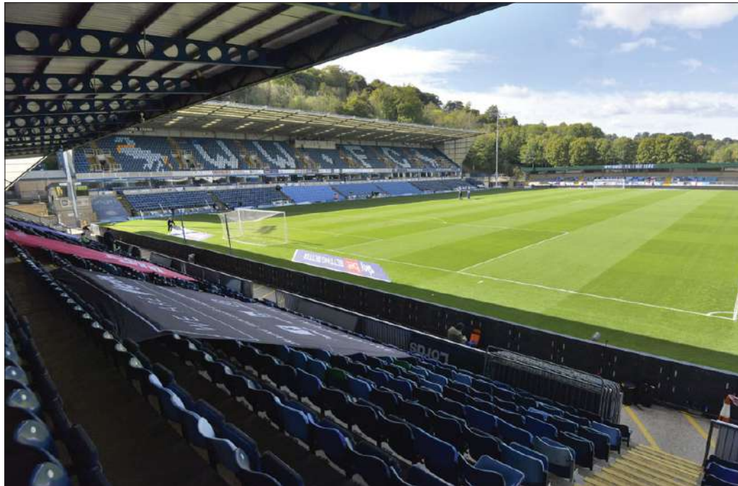
Couhig spoke to the Free Press on June 17 about all things Wycombe and Reading.

"I love Wycombe and I will help Wycombe no matter what, but I thought