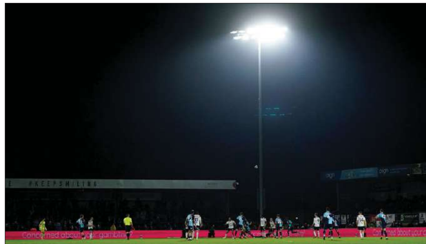
Wycombe were rated 56th in miles travelled last season.

It took place on the penultimate weekend of the season (Wycombe would later play Cambridge United three days later in their final away game of 2023/24), where they won 3-1 at Brundon Park.