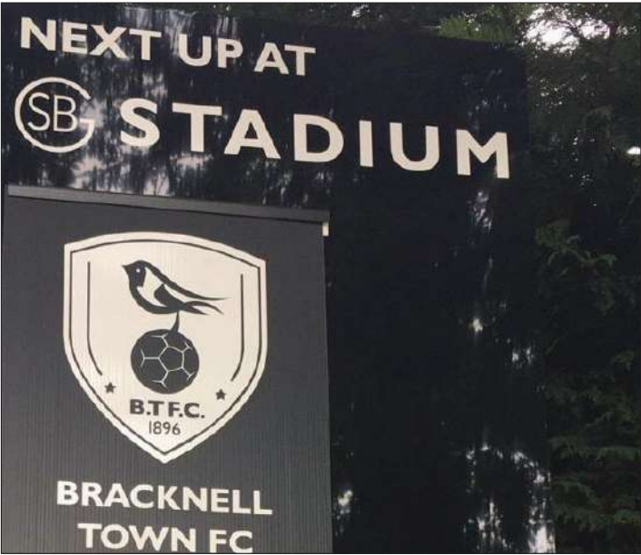
Wycombe have not won the Berks & Bucks Cup since 2012. They also lost 2-0 away at Bracknell in a pre-season friendly back in July 2022