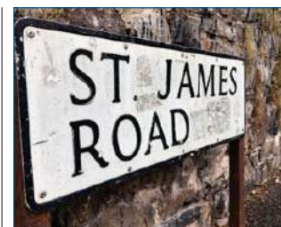
Where Exeter play (NQ)