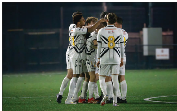
Windsor celebrate victory.

Windsor travel to Penn and Tylers Green on Saturday (3pm ko).