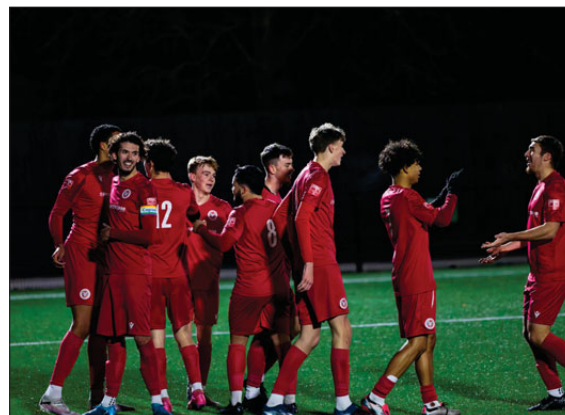
Beaconsfield celebrating the winner.

Beaconsfield return to league action tomorrow with a tough test at Holloways Park when they face Real Bedford.