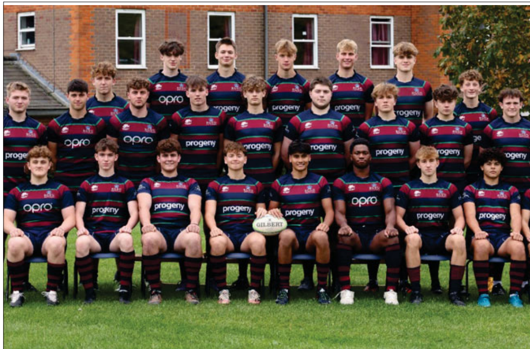
Royal Grammar School, Wycombe

"Whenever you get to these rounds it's always going to be a tight contest so sometimes it's a bounce of the ball, a referee