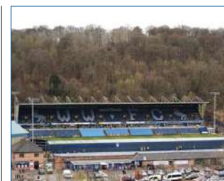
Another win for the Wyc (PA)