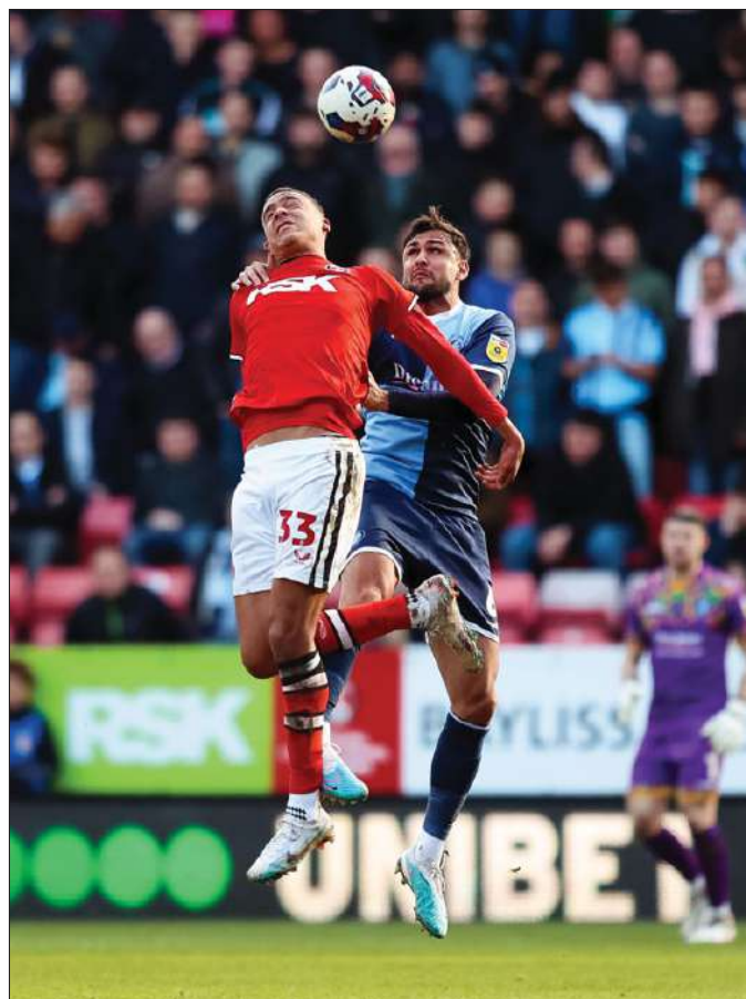
Wycombe drew with Charlton 1-1 last season at the Valley

A win for Wanderers could see them move into the top six.