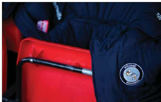
Hummel will make Wycombe's shirts until 2028