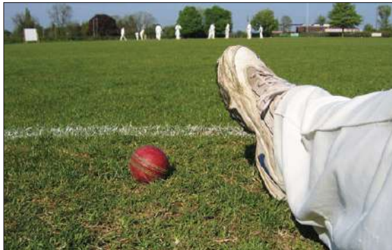
The draw happened at the High Wycombe Cricket Club