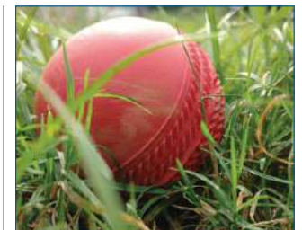
The match happened on June 24

WYCOMBE Wanderers Women's revealed their End of Season Award Winners on Saturday, to conclude the 2022/23 season.