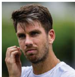
CAMERON Norrie is the only British seed at Wimbledon.