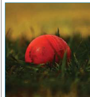
It wasn't Bucks' day

BUCKS ended their National Counties Trophy campaign by falling to a heavy nine-wicket defeat against NC Wales at Slough on Sunday.