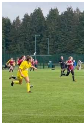
It was a good day for WWWU18

WYCOMBE Wanderers Women Under 18s smashed Tilehurst Panthers 4-0 on October 10.