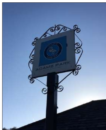
Wycombe have won their last seven league games at Adams Park