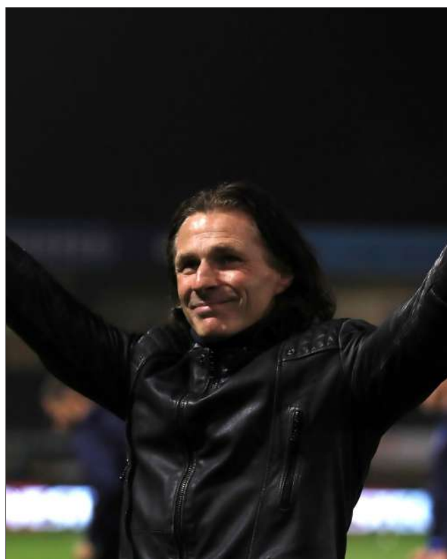
Gareth Ainsworth was speaking after Wycombe's 2-0 win over Gillingham on Saturday, October 9

GARETH Ainsworth still believes that he is a 'novice' in the managerial game and has thanked his previous and current chairmen for support.