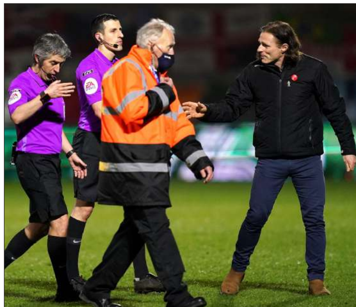
Wycombe Wanderers manager revealed the good news after the 0-0 draw at home to Shrewsbury Town on Tuesday, February 8