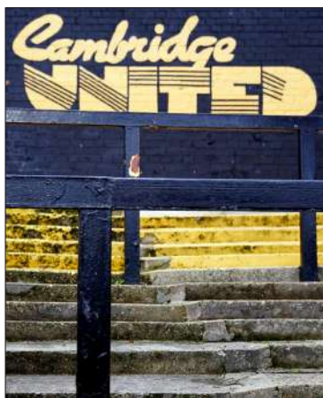
Wycombe will visit the Abbey Stadium in April to face Cambridge United

"The boys have been chomping at the bit to get out and back on the pitch as they want to play games to put things right, but I think we needed that break as it's a long season, we need to look at things but we are in a good position."