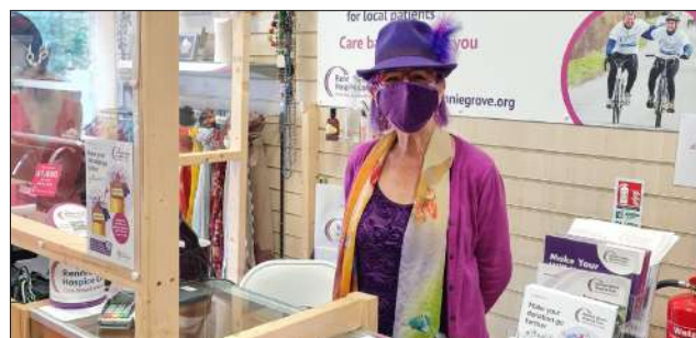
Dedicated volunteers keep Rennie Grove's charity shops thriving

"If you have skills you'd like to use - or new skills you'd like to learn - do get in touch. We'd love to chat with you about how we might be able to help each other."