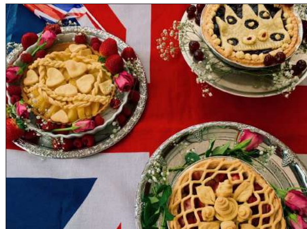
A lot of time and effort went into the design and baking process