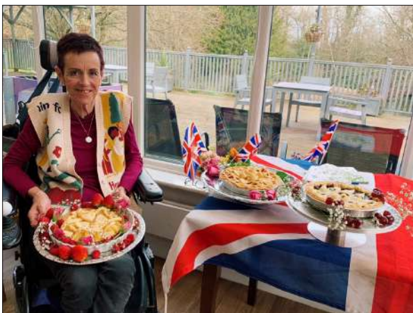
The delicious pies

Their fabulous puddings are a Trio of Pies, called 'Long May she Reign!' which consists of an apple and elderflower pie decorated with pastry hearts, plaits and twists surrounded by strawberries and roses, a black cherry pie decorated with a pastry crown and glacier cherries and a strawberries and cream pie.