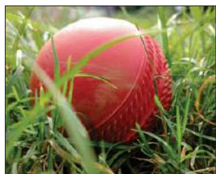
It was a great win for Buckinghamshire

BUCKS pulled off a stunning three-wicket victory over first-class opponents Leicestershire at Grace Road