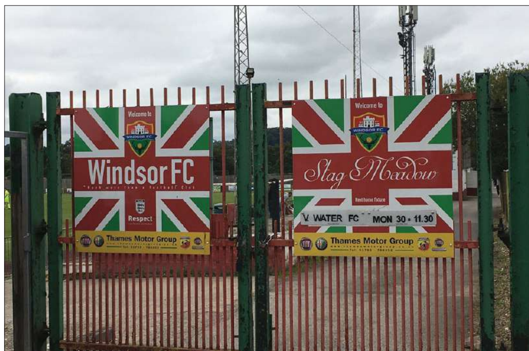
The match took place earlier on this month