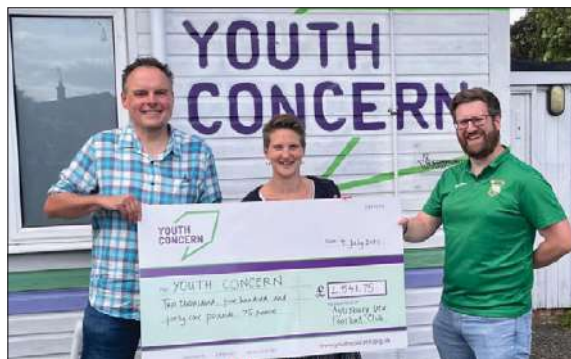
Support for Youth Concern

"The money raised has enabled us to do more activities with young people at our Drop-in Centre and our supported housing project."