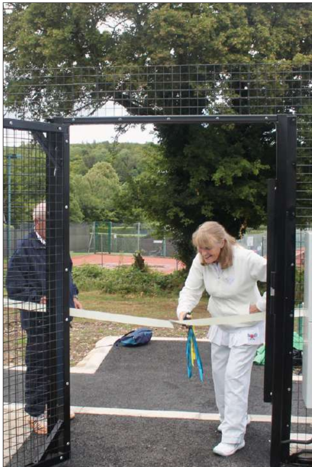
The courts opened earlier on this month and have been well-received by the public

- Scoring in padel sport follows that of tennis: 15, 30, 40, game - 40-40 is a deuce