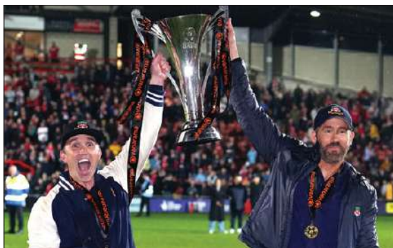
Rob McElhenney (left) and Ryan Reynolds (right)

Billionaire-backed Wycombe will be hoping to spoil the Hollywood party at the Racecourse Ground, with the fixture streamed live on Sky Sports.