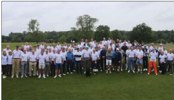
Many people took part on the day as an incredible £120,000 was raised for Alzheimer's Research UK

AN incredible £120,000 has been raised for Alzheimer's Research UK following a successful event at Harleyford Golf Club.