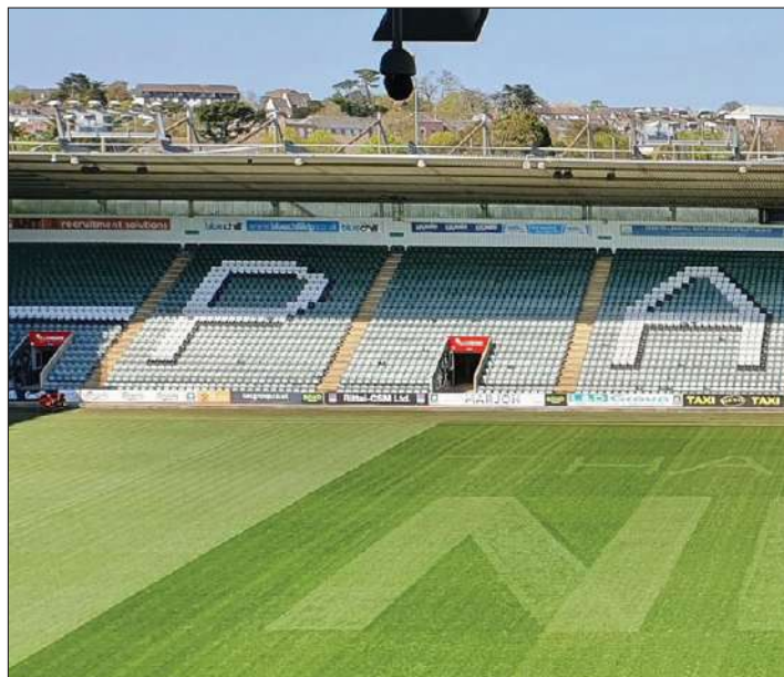
Wycombe travel to Home Park on December 29 for the club's final game of 2022

based team defeated Wycombe in the previous meeting nearly three months ago at Adams Park, the Chairboys did complete the double over the Greens last season. During the two matches, Wycombe beat Plymouth 3-0 at Home Park and 2-0 at Adams Park, with the Chairboys pipping their counterparts for the final play-off place at the back end of the previous campaign. Collectively, the two clubs have played each other 31 times with Wycombe earning 12 victories, Plymouth 10, along with nine draws. To purchase your ticket, go to www.wwfc.com/tickets .