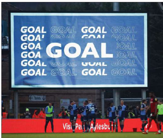
Wycombe Wanderers entered the play-off places after comeback win over Bristol Rovers on December 26

The latter was with Sam Vokes, with the two being teammates at Turf Moor.