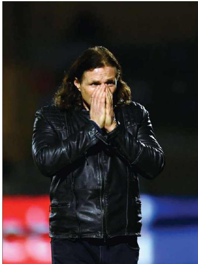
Ainsworth will see his team travel over 600 miles across three days (PA)

To see reports on Wycombe's match against Plymouth, visit www.bucksfreepress.co.uk/sport , or go to @James_BFP on Twitter.