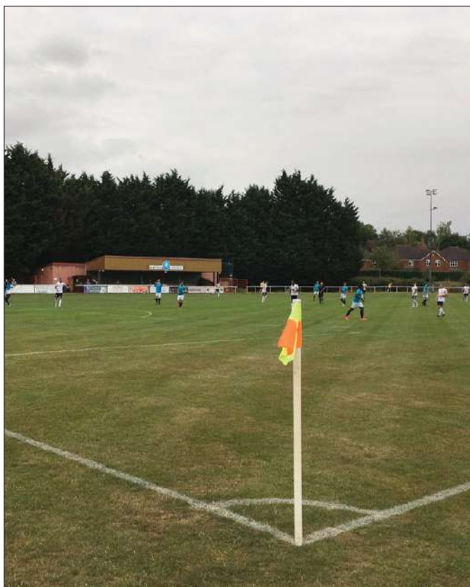
The merger between the two clubs was confirmed on June 3, with Buckingham playing their games at Stratford Field (pictured)