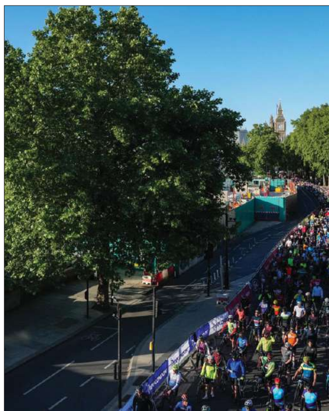
The RideLondon-Essex 100 took place on May 28

A BEACONSFIELD father-of-two has cycled 100 miles in memory of his friend who died of a brain tumour.