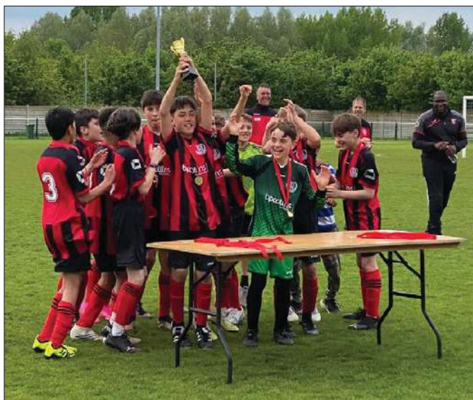
It was a good day for Thame at the end of the season

TWO football clubs within the county have merged into a solitary side as preparations for the 2023/24 Non League season continue.