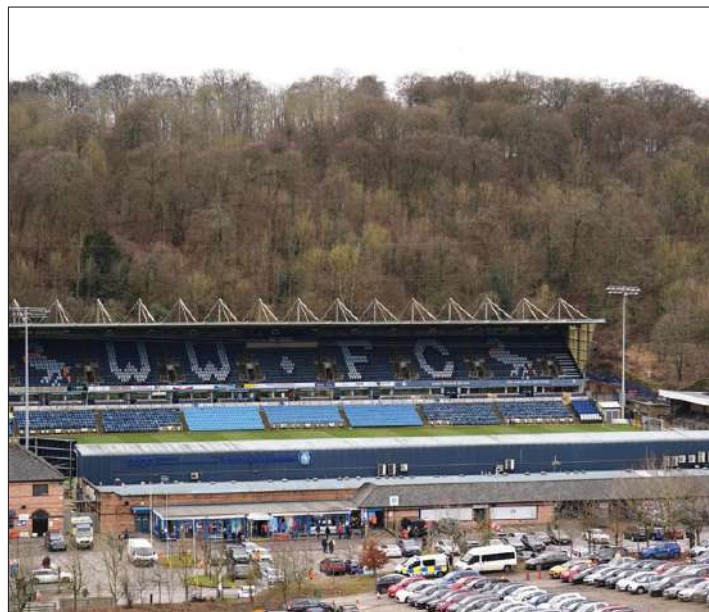
This summer is expected to be a busy period for Wycombe in terms of transfer activity

"Everybody in this team is very special to me, they all become your closest friends. I've shared Olympic finals with lots of them and it was cherry on top to be able to get the win with them, despite it being much closer than we wanted it to be."