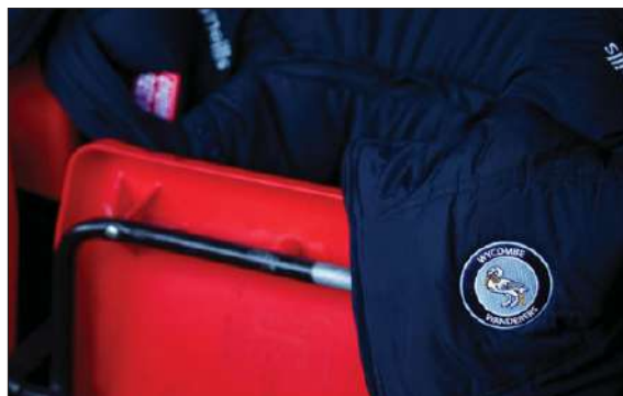
Wanderers' new kit supplier were announced on June 1