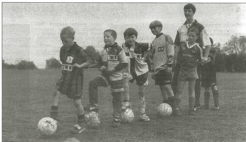
Queueing up for coaching: Youngsters take part in a previous funweek organised by the club