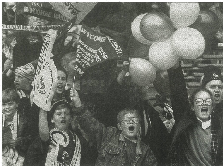
In for a pound: Youngsters can gain admission at a cheaper rate for the Stockport County game

WE carried out a detailed supporters' survey to assist the club in continually improving every area of service, quality and value for money in August 1994.