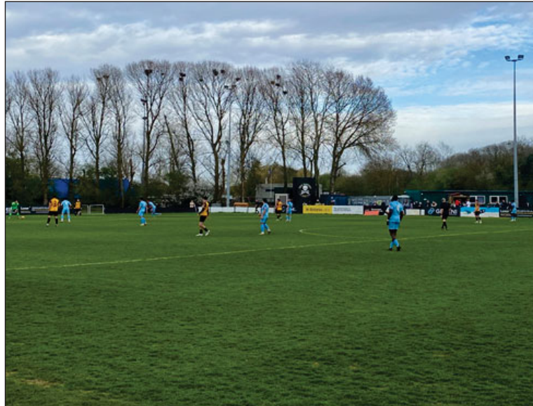
Beaconsfield take on Real Bedford.

Real Bedford sit nine points clear at the summit of the Southern League Central Division, with Beaconsfield in 10th, looking to return to their recent impressive end of season form when they travel to Kings Langley tomorrow afternoon.