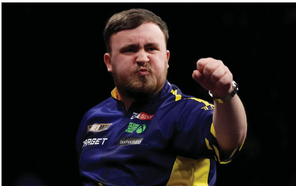
Luke Littler hopes to eventually beat Phil Taylor's record of 16 world championship wins

Infantino would not commit to any timescales to put any element of the calendar proposals to a vote, with the next scheduled FIFA Congress in Doha on March 31 next year.