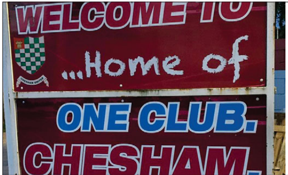
Chesham United's home, The Meadow

CHESHAM United Women now know their fixtures for the upcoming FAWNL campaign.