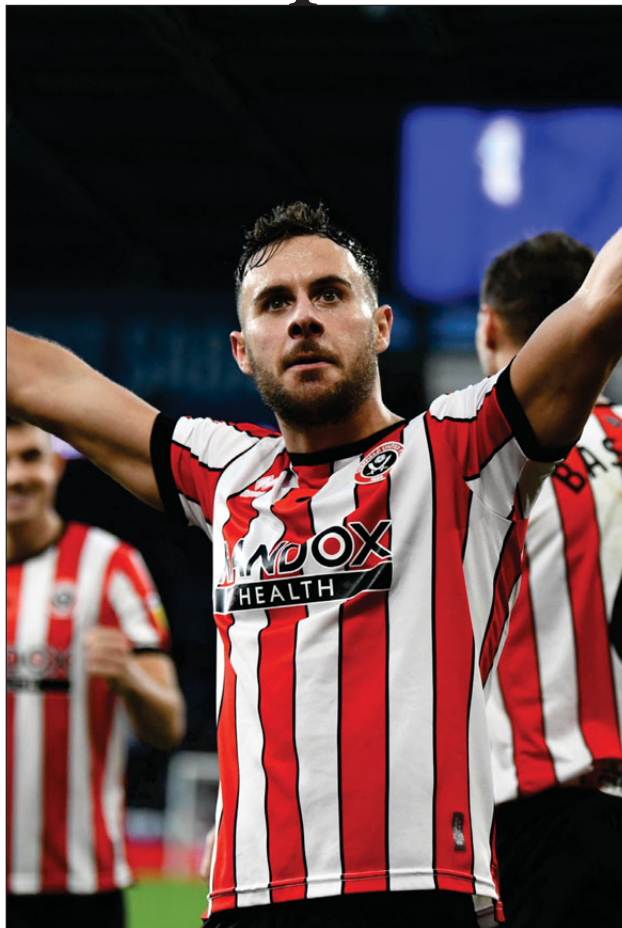
Bucks-born George Baldock enjoyed a successful career in the EFL and Premier League.