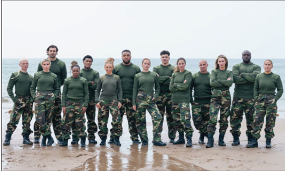
A group shot of all recruits lined up on beach (Channel 4)

WYCOMBE Wanderers legend Adebayo Akinfenwa has been named in the upcoming series of a popular reality TV show.