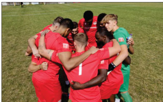
Beaconsfield ahead of the 3-0 victory.