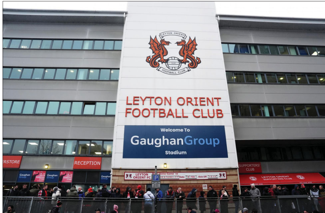
Wycombe's win over Orient was their first this season