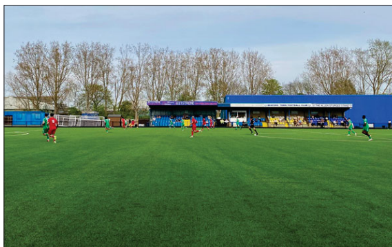
Beaconsfield take on Biggleswade.

Beaconsfield return to action on Bank Holiday Monday, with a short trip to local side Flackwell Heath.