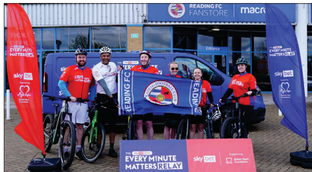
Every Minute Matters Relay hits Reading and Wycombe Wanderers.

WYCOMBE Wanderers' Adams Park was the latest stop on the Sky Bet Every Minute Matters Relay.