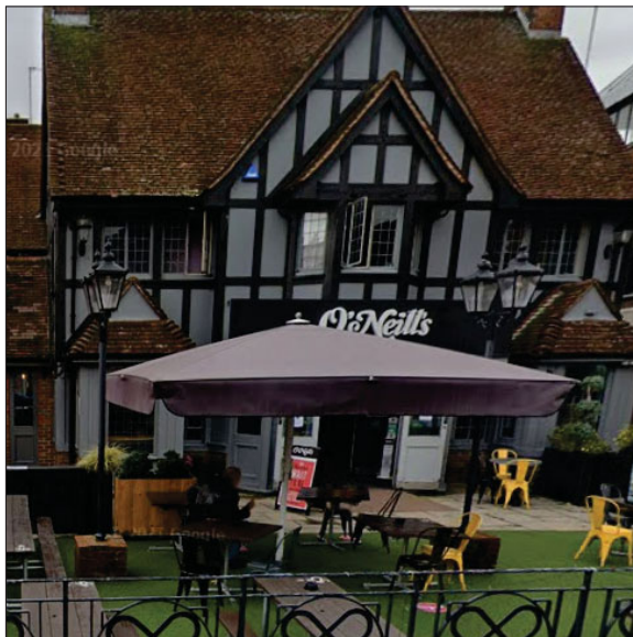
O'Neill's, High Wycombe

A BUCKINGHAMSHIRE man has been ordered to pay more than £1,300 after an incident at O'Neill's in High Wycombe.