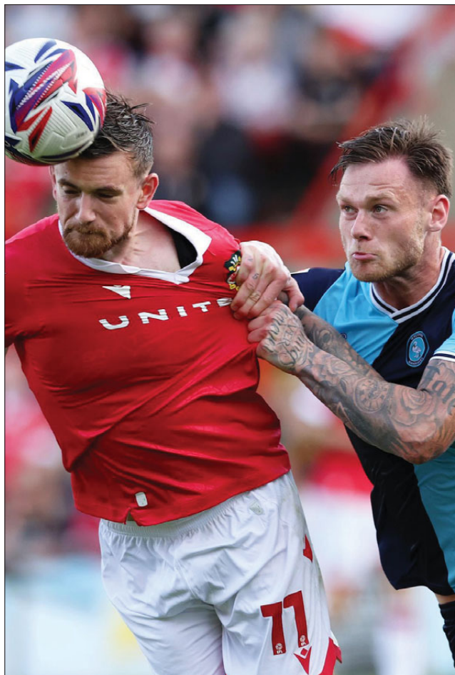
Wycombe last played Wrexham on the opening day of this season, where they narrowly lost 3-2