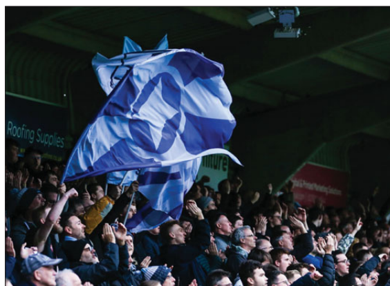
Some 9,000 people are expected to attend the Wrexham clash

"We're at the business end of the season and there are parts of the game I like and some I don't like and we just need to stay balanced and we know it'll be a rollercoaster."