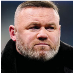
Former Manchester United forward Wayne Rooney

WAYNE Rooney thinks Manchester United look "lost" and "scared" on the pitch and that "10 to 15 players need to leave the club".