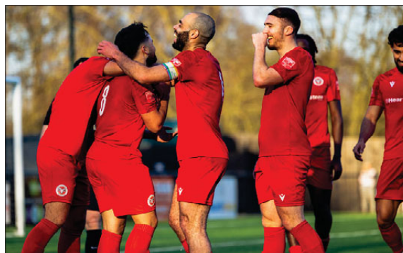
Beaconsfield celebrate their 3rd.