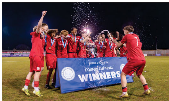
Beaconsfield U18's celebrate a historic win.

BEACONSFIELD Town won a third cup final in three seasons in the Berks and Bucks under 18 cup, with a penalty shootout win over Chesham United, writes Arran White.