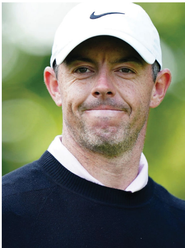
Rory McIlroy is still to finalise his schedule ahead of the Masters

"I think being able to take your time away from the tournament and doing it is a nice thing."