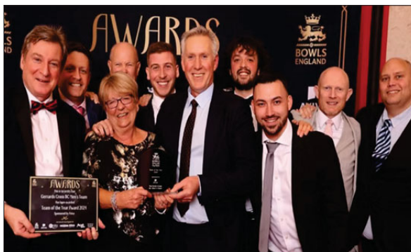
Gerrards Cross picking up prestigious bowls award