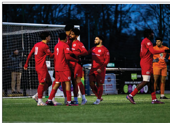
Beaconsfield celebrate their second.

Beaconsfield are back at Holloways Park tomorrow at 3pm when they face Leighton Town.