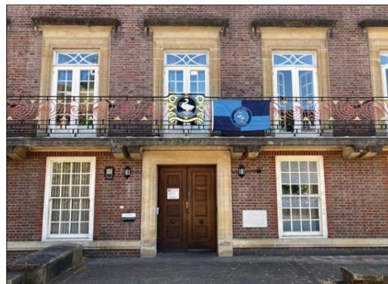
The flag was been put up ahead of the Charlton tie

To read the outcome of the match report as well as reaction, please visit the Free Press website.