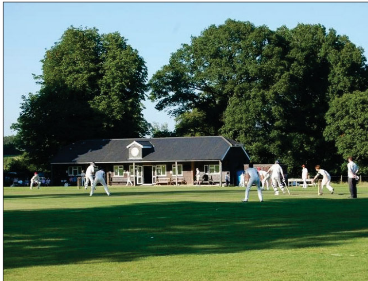
Lee Cricket Club

Finally, towards the end of the season, Sunday August 24 sees an MCC XI visiting The Lee CC to play a commemorative match to mark this historic year in the club's history, with play starting at 11.30am. Promising to be a special occasion, it is hoped there will be lots of local support for the home side as they take on a team from one of the most illustrious clubs in world cricket.