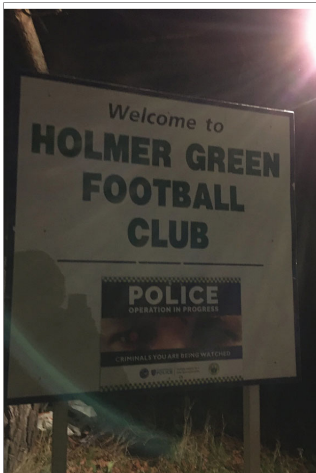
Holmer Green FC