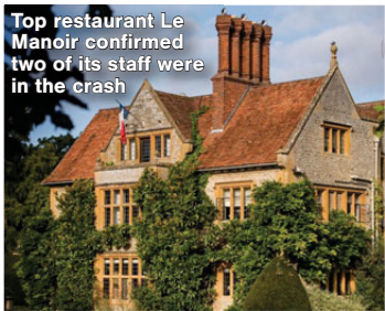
Top restaurant Le Manoir confirmed two of its staff were in the crash