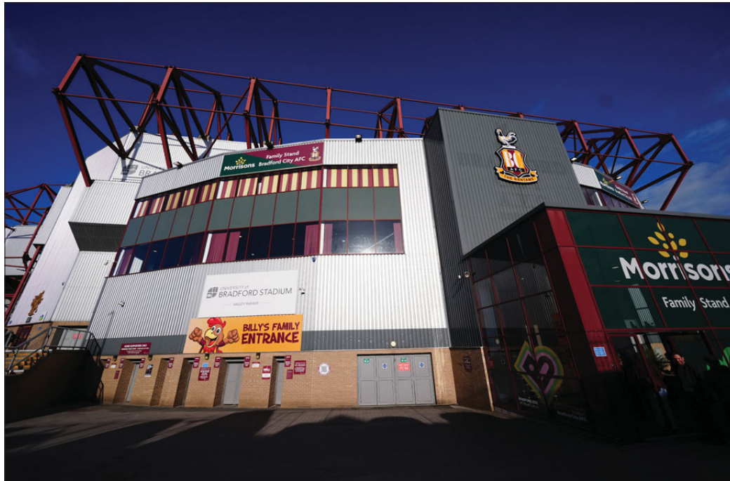
General view outside Bradford City Football Club.