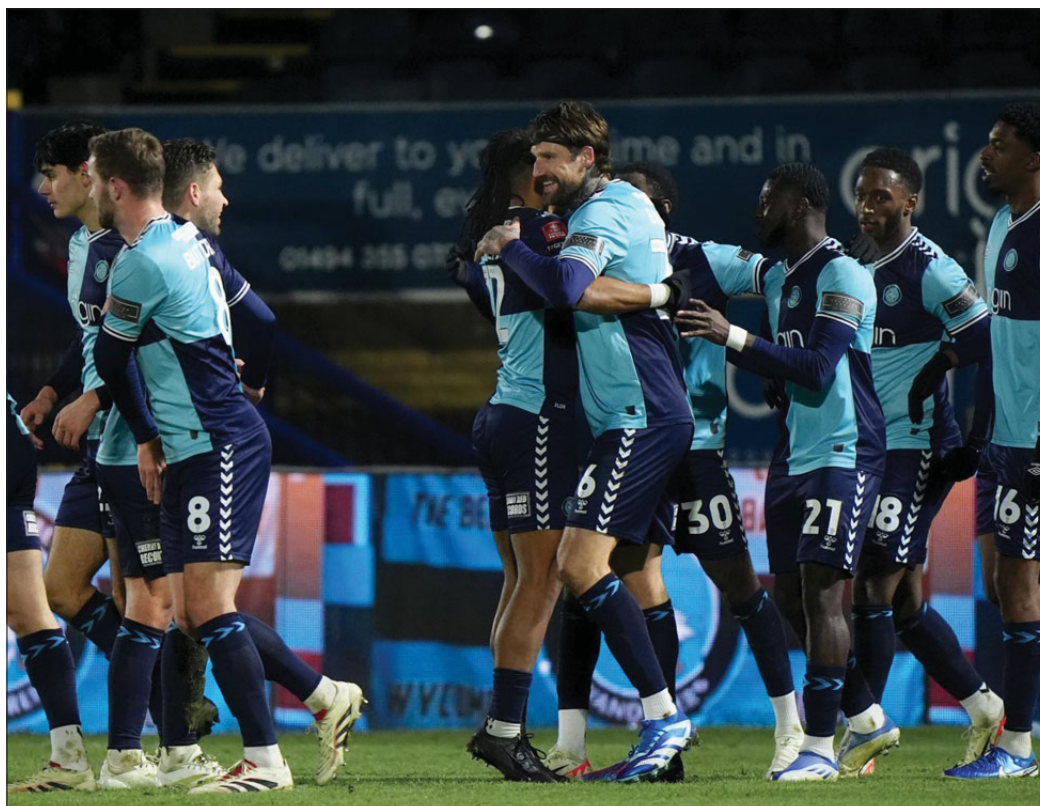
Wycombe made four changes in the 2-0 win against Bristol Rovers on February 18.

Both of Wycombe's goals were scored the opening 15 minutes of the second half, which took the game away from Bristol Rovers who lacked any real attacking threat.