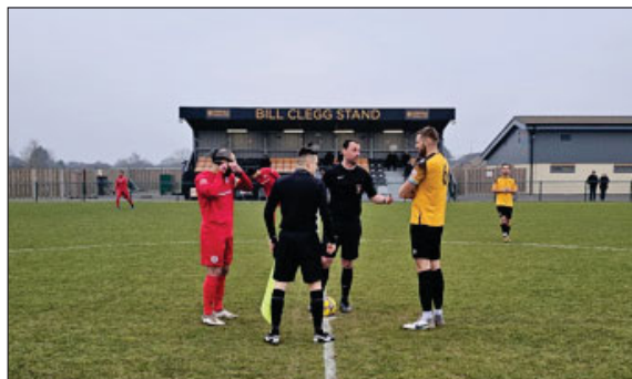
Beaconsfield Town edged Stotfold on Saturday.