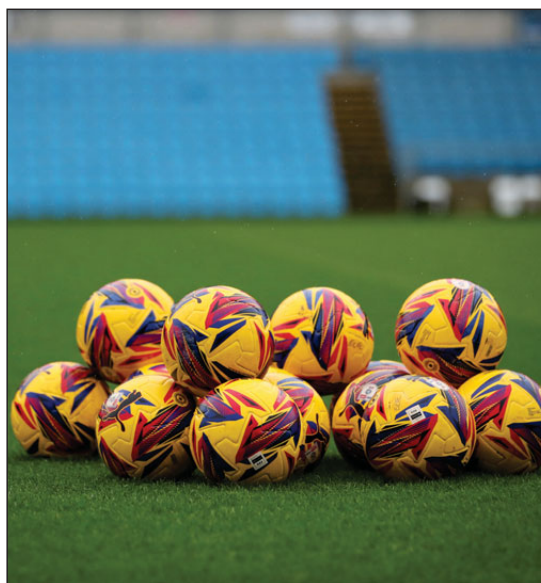
A big win for Wycombe Wanderers Women.

The Wanderers now take on Penn & Tylers Green Ladies in the rescheduled quarter final of the Berks & Bucks County Cup.