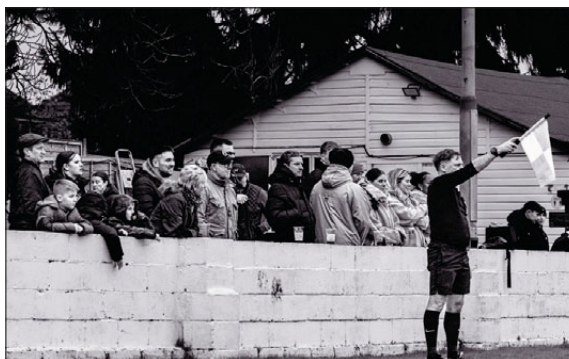
Flackwell left it late to beat Enfield.