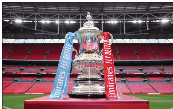
Wycombe are in the FA Cup fourth round

The previous three encounters have all taken place at Adams Park, with North End winning two and Wanderers winning one.