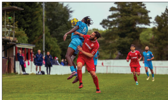
Flackwell Heath edged Beaconsfield Town.