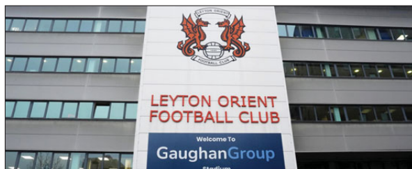
Wycombe will play Leyton Orient on April 26 at Brisbane Road

TICKETS for Wycombe Wanderers' final away game of the season at Leyton Orient have officially sold out.