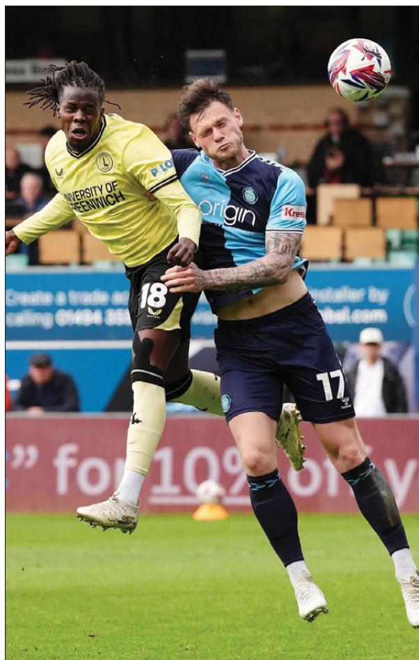
Wycombe Wanderers' 4-0 home loss to Charlton Athletic was their heaviest of the season.