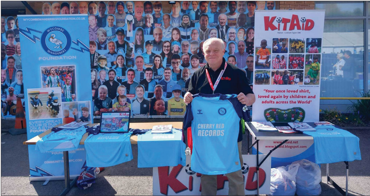
The donated football shirts will be sent across the world