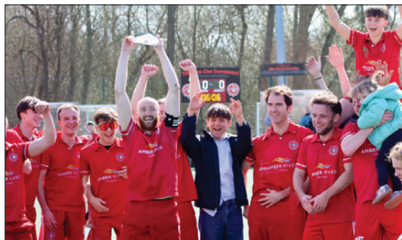
Marlow receive their pennant for promotion

HAVING won their last match, Marlow Hockey men's first team were presented with the pennant awarded to the winners of South Central Premier League One.