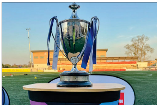
The Berks & Bucks FA Cup.