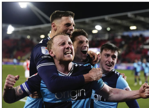
Wycombe sit three points off the automatic promotion places

"If we do that for the next five games, we give ourselves a chance of being successful."