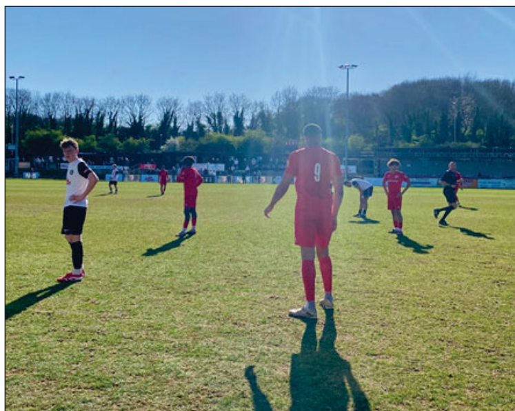
Beaconsfield take on Kings Langley'.

Beaconsfield are on the road again tomorrow, travelling to Biggleswade FC.